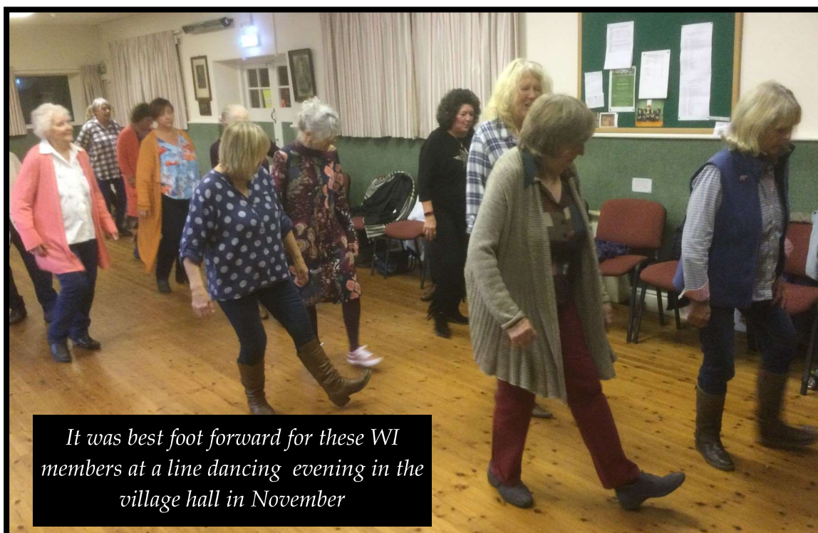
It was best foot forward for these WI members at a line dancing evening in the village hall in November